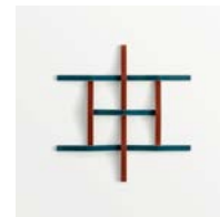
Adagio Rosso + Blu