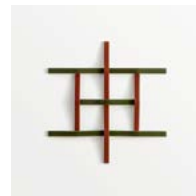
Adagio Rosso + Verde