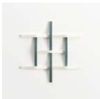
Adagio Grigio + Bianco