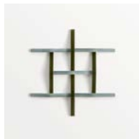
Adagio Grigio + Verde