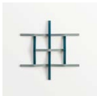
Adagio Grigio + Blu